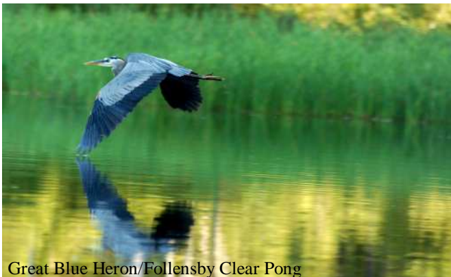
Great Blue Heron/Follensby Clear Pong

Join a naturalist on The Wild Center trails every Sunday morning in June and July for a bird walk and coffee. Learn the basics of bird identification, stop at the bird blind, search for nests, and maybe even learn a few songs of our summer residents. Afterwards, enjoy a relaxing coffee and snack break on our patio by Greenleaf Pond. Later in the day, the bird list will be posted on The Wild Center's twit-