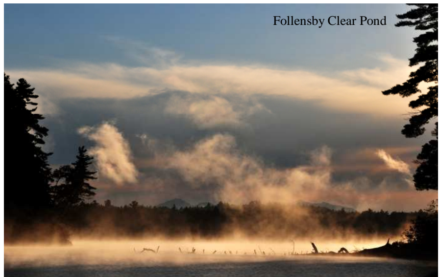
Follensby Clear Pond

Directions: The Wilson Hill boat launch is located just west of Massena on the Wilson Hill Causeway just 550 feet north of its junction with Route 131. From the east (coming in on Rte 37): take a right onto Willard Road which is about 4 miles from Rte 56/37 intersection, continue down Willard Road to its intersection with Route 131, cross intersection and boat launch will be on the right. From the south (coming in on Rte 56 or 420) take a left onto Rte 37 and take a right onto Willard Road and follow directions above. From the west (coming in on Rte 37), look for Rte 131 on the left approximately 10 miles east of Waddington, next left is the Wilson Hil Causeway.