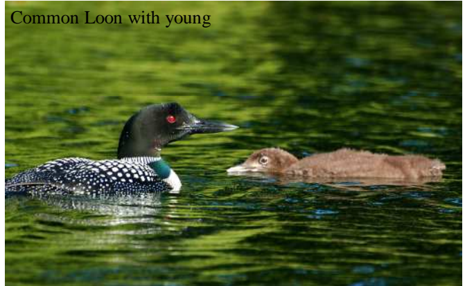
Common Loon with young

All photographs this issue by Pete DeFina